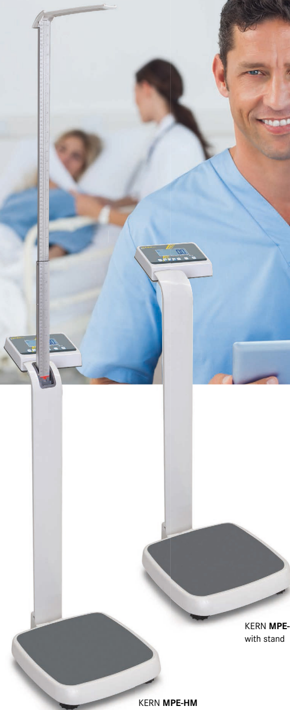
KERN MPE-PM with stand